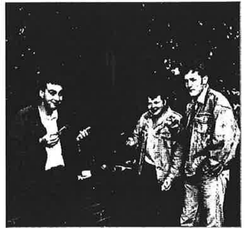
Left: Picnickers queue for food under brollies!