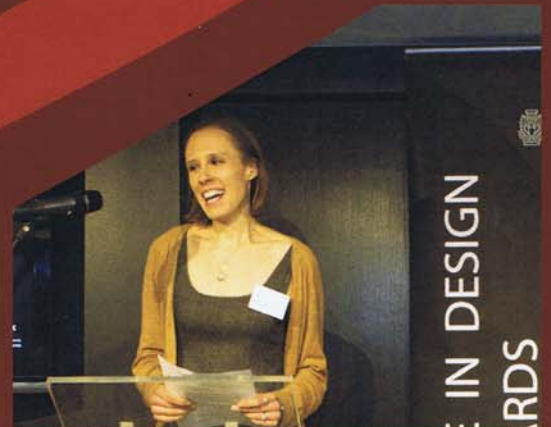
Design Awards Gala Photos

AIA NATIONAL CONVENTION June 26-28th Chicago, Illinois