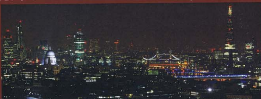
View from 2014 Design Awards Gala Venue