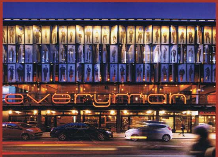
Everyman Theater Liverpool