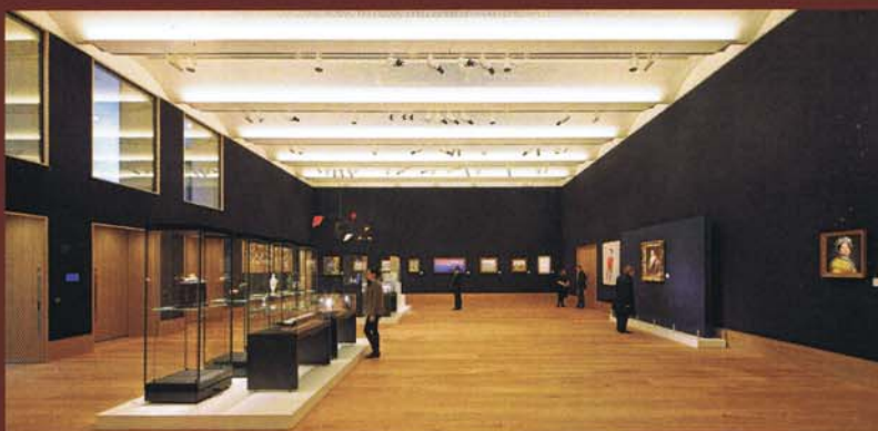
Bonhams, 101 New Bond Street, London