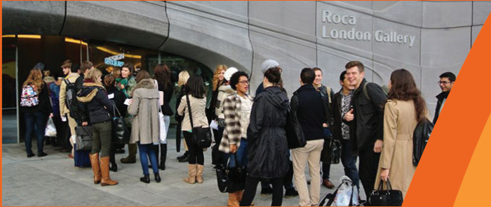
Student Design Charrette

A Chapter of The American Institute of Architects