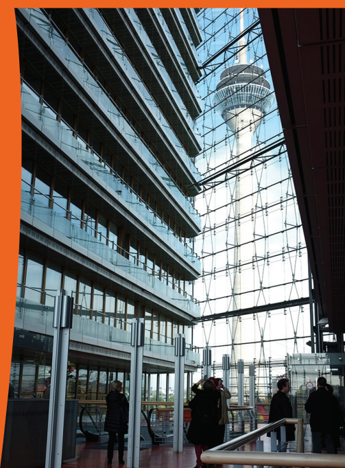
Düsseldorf Staatskanzlei Building by Petzinka Pink and Partner