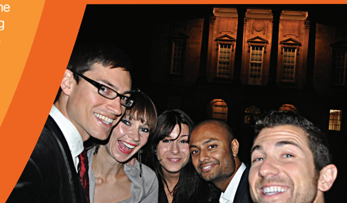
AIA Members at Bath Excursion Gala Dinner