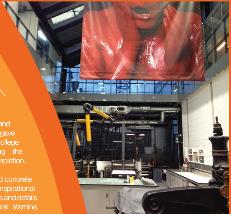
RCA Dyson Building

The 2013 AIA building tours concluded with the tour of the Hotel ME by Fosters + Partners. Architect Nick Lang hosted the tour. This five star hotel, located in Central London and close to the River Thames, is the very definition of luxury hotel. The modest and elegant façade responds well within the urban context while the interior is evidence of the design quality throughout the building. The building seamlessly integrates part of the historic Marconi House. Individual rooms can be defined as minimalist with the main feature being the external triangular frameless windows. Various restaurants occupy the ground floor while the main hotel reception is located on the first floor. The welcoming element at the reception is the large triangular atrium with a small window on the top. As simple as it sounds, this is the most powerful space in the building. At the top, the hotel accommodates a bar with glazed façade all around and a balcony with a seating area which affords the most impressive views of the capital.