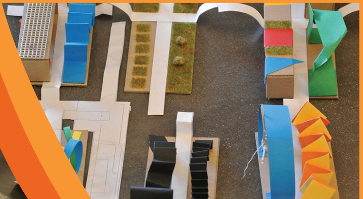
Student Design Charrette