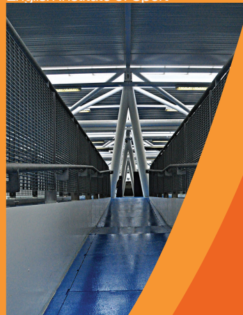
Bath Excursion - Photos by Toby Cisneros