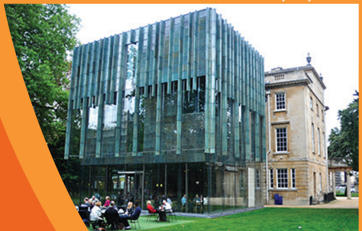
Holbourne Museum Addition