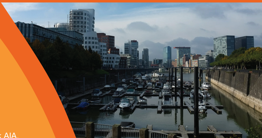
Düsseldorf Media Harbor

Friday will focus on King's Cross. The centrepiece is the 27 hectare redevelopment in the area immediately north of the Kings Cross and St Pancras train stations. We will have presentations on the masterplan, and we will tour a number of the buildings including Kings Cross station, St Pancras station, University of the Arts and others. Saturday we will be in London Bridge, which has undergone significant redevelopment with More London (masterplan by Foster), Borough Market, and more recently with the tallest building in Europe, the Shard (Renzo Piano). Finally, on Sunday we will visit the Olympics in east London. We will have an overview of the Olympics development, and the extensive legacy plans. We will also visit the Velodrome (Hopkins) and the Aquatics Centre (Hadid). We hope you will join us! Registration will open in February on the AIA UK website.