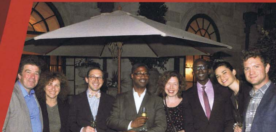
Summer Gala, Merchant Taylors' Hall