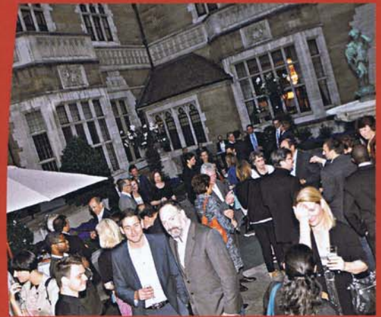
Summer Gala, Merchant Taylors' Hall