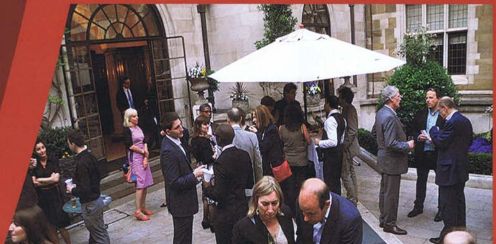
Summer Gala 2013

National dues for all categories of membership will not increase from 2013 levels. And, the AIA UK board of directors voted unanimously to keep the AIA UK dues at the same level they have been at for the last few years! Dues for 2014 are for AIA UK and National, respectively: Architect - $165 / $214, Associate - $83 / $108, International Associate - $165 / $182.