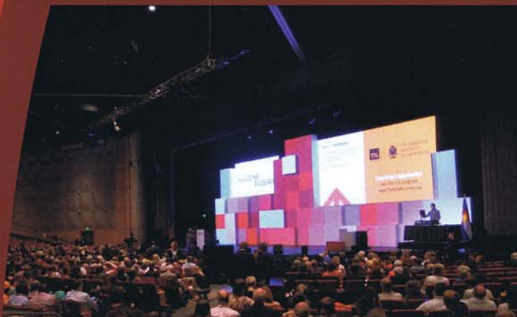
AIA National Convention, Denver, Colorado