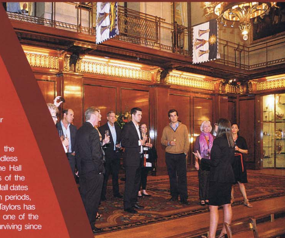
Summer Gala, Merchant Taylors' Hall

As 2013 Chapter President I would like to thank everyone who attended: your presence is what made such a fun and memorable evening. Special thanks must also be given to our long-term sponsor, Call Print, for the expeditious printing and banner making; and for helping on the day – from start to finish. Finally I would like to recognize our AIA UK Board Members, Officers and our Chapter Executive who assisted with the organization of the event, and were there on the day to greet guests – thank you all for your time and efforts. We hope to see you all again next year.