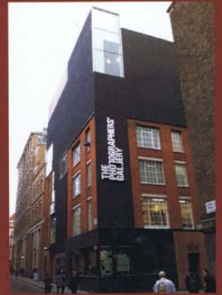
The Photographers' Gallery