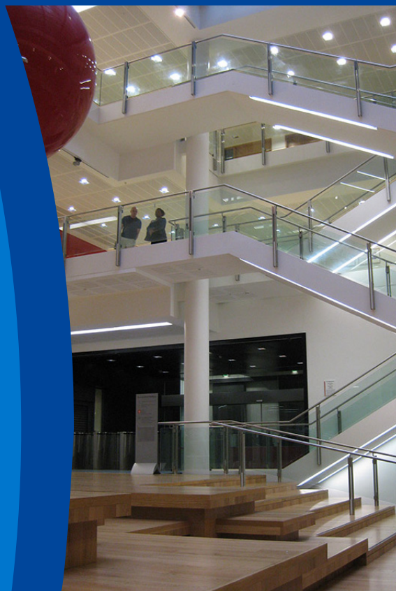
LSE New Academic Building