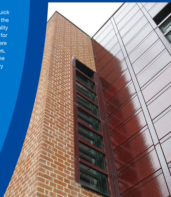
Pallant House Gallery, Chichester