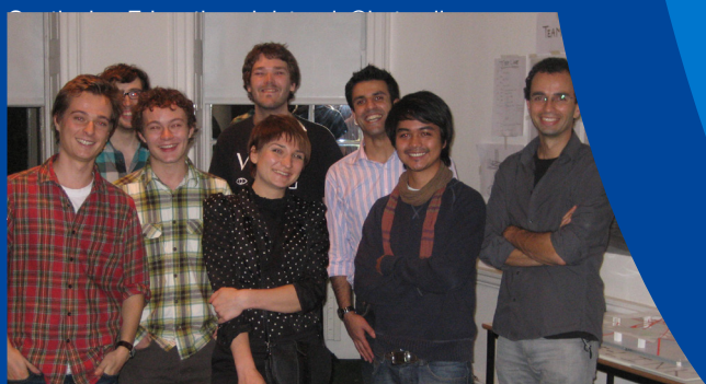
Student Charrette Second Place Team