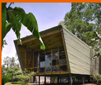
Casa Kike Costa Rica Gianni Botsford Architects