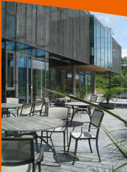
Wellcome Trust/EBI Campus