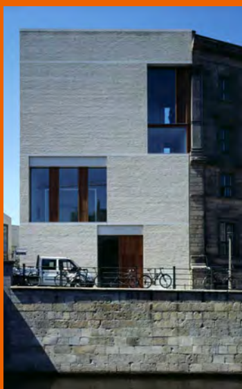
Am Kupfergraben 10 Berlin, Germany David Chipperfield Architects