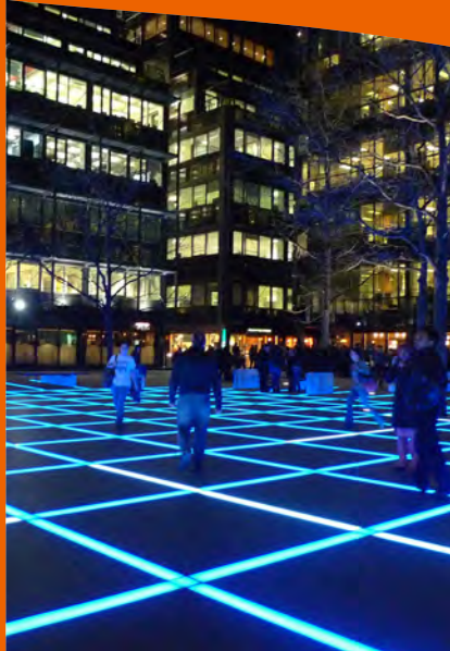
Finsbury Avenue Square