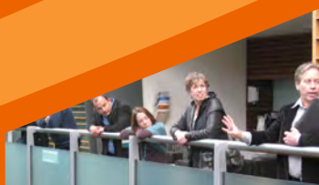
Wellcome Trust/EBI Campus