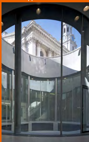
St. Martin-in-the-Fields London, UK Eric Parry Architects