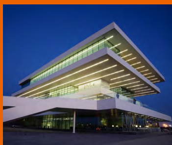
America's Cup Building Valencia, Spain David Chipperfield Architects