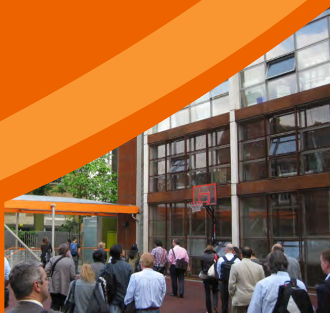
St. Marylebone School