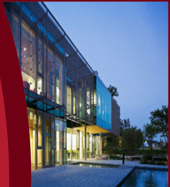
Welcome Trust Campus