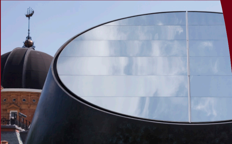
2008 Winner : Royal Observatory, Allies and Morrison

A Chapter of The American Institute of Architects