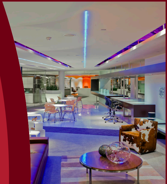
Herman Miller Showroom