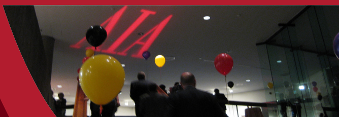
AIA Headquarters Open House

In the end, the conference provided a wonderful opportunity to meet other component officers, to share experiences of running an international chapter and to get a better understanding of the organization of the AIA.