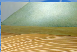
Maya Lin Installation

The final film of the year was held on Friday, 14 November at the BFI Screening Room. A futuristic image of Los Angeles was portrayed in Ridley Scott's Blade Runner: The Final Cut, which was released last year. Even though the film series has come to a close for this year, please keep your eyes open for next year's film selections!