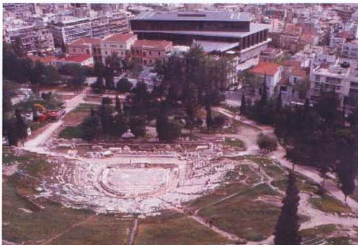
View of the Museum from the Acropolis

Details of the conference will be worked up over the next months; volunteers should contact the Chapter Executive.