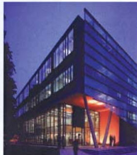
Wilinson Eyre City and Islington College One of the 2008 winners