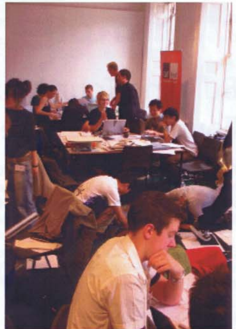
Students Compete in Annual Charrette