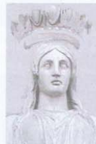
ALL PRINTING COURTESY OF

St Pancras Parish Church (a Grade 1 Listed Building) is a unique Greek revival church in central London. It was completed in 1822 by the architect, William Inwood, who modeled St Pancras on the Ionic Temple of the Erechtheum on the Acropolis in Athens. It is particularly well known for its distinctive 'caryatids' standing on the north and south sides. The church was part of a larger master planning concept initiated by likeminded Greek oriented intellectuals. It was an extension of the Greek inspired Regent's Park designed by architect John Nash. The Church is now in need of extensive restoration; donations for refurbishment and upkeep will be welcome. website: www.stpancraschurch.org