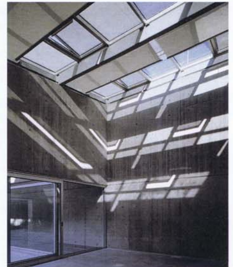
AIA/UK Award Winner - Light House - for a slide show of all winning projects go to the Chapter web site, www.aiauk.org