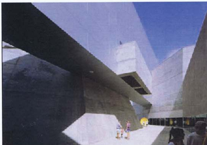
Arizona Science Center