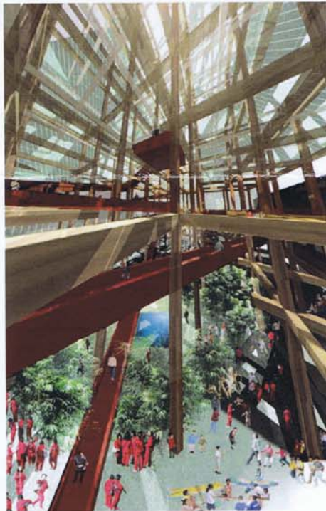
National Palace Museum, Taiwan

Predock's design process includes the use of large collages and clay models. The use of sculptural modelling is evidenced in projects such as the Spencer Theater for the Performing Arts that has a commanding presence in its mountainous setting.