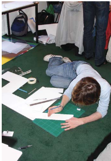
... getting down to work ... at the student charrette