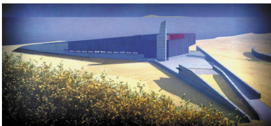
Private Residence Long Island New York