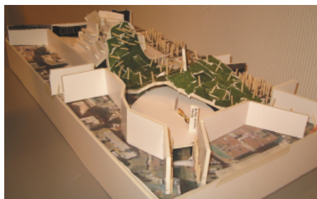
The Alps arrive in East London

The Student Design Charrette is one of several annual events sponsored by AIA London/UK. It brings together students from universities all over the U.K. including those who are working in practices during their year out. Now in its 12 th year, the charette is sponsored by CallPrint who provide free reprographic services to the students.