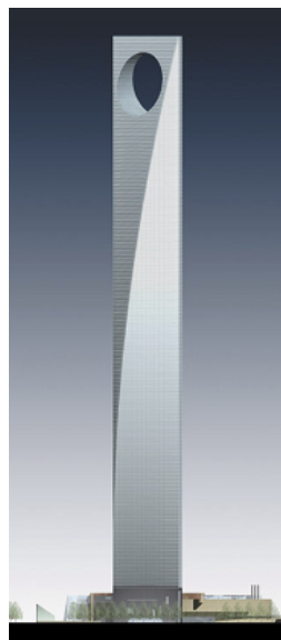
Tower Shanghai China