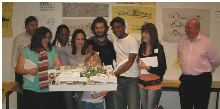
Winning Team from University College for the Creative Arts