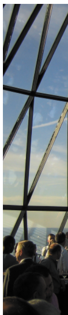
SUMMER EVENT above.....

On High - Smart Buildings - Clean Air - On Tour