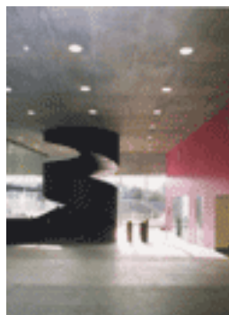
The LABAN Dance Centre 'Spiral' from the AIA London tour in May.