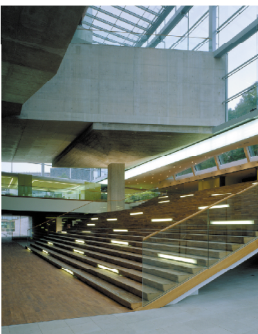
Brisac Gonzalez Architects for the Museum of World Culture Gothenburg, Sweden