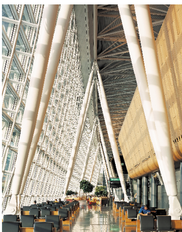
Grimshaw for the Zurich Airport 5 th Expansion: Landside & Airside Centres Zurich, Switzerland

Date: November 2005 TBC Venue: RIBA (TBC) / 1.5 CES units