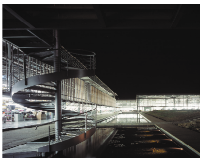
Grimshaw for the Rolls-Royce Manufacturing Plant and Headquarters West Sussex, UK