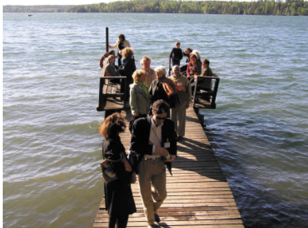
AIA members on the lake below the homes and studios built by Gesellius, Lindgren and Saarinen (HVIITRÄSK) in 1901. These natural settings an inspiration in much Finnish Architecture over the last century.

Although it would be stretching it to say that Finnish architecture is extreme architecture, it cannot be denied that the northern climate gives it a distinctive character of its own. Façade colour becomes important in breaking the monotony of grey skies. An architectural competition is won on the basis of an enclosed pedestrian route. Triple glazing and double skin facades are commonplace. And where else are an architect's designs routinely depicted at night and covered in snow?