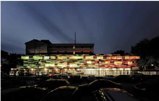
Sauerbruch Hutton Architects for the Fire and Police Station Government District, Berlin