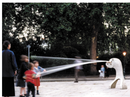
A.Inge Horton Hears a Who concrete, steel, timber height 120 cm