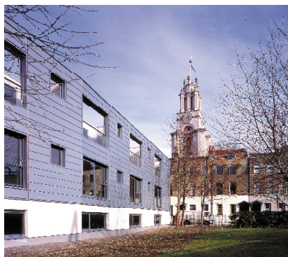
Stephen Davy Peter Smith Architects for the Swallow Place London