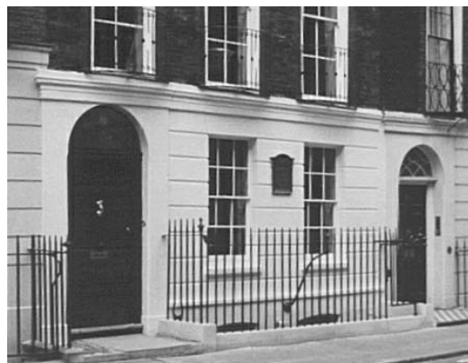
The Benjamin Franklin House, just off Trafalgar Square, provides the London/UK Chapter with its office and mailing address.