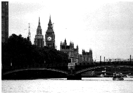
The Thames, Big Ben & Parliament