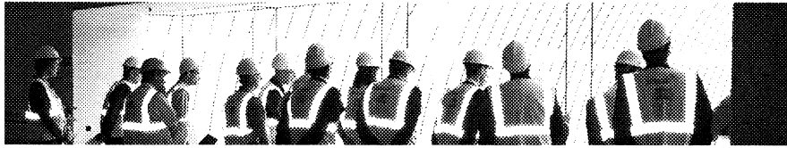
Admiring the view over Covent Garden, ROH, 28/7/99