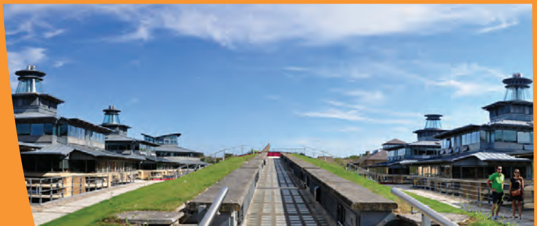
Edward Cullinan's Centre of Mathematics

In short a terrific weekend was had by all and we were pleased to have a few guests from Grohe, the sponsors of the event. We thank them for their support of this fabulous weekend and hope to see them again next year. Suggestions for city excursions in 2013 are welcome!