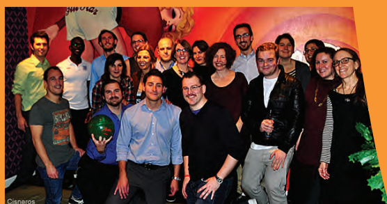
Bowling Night