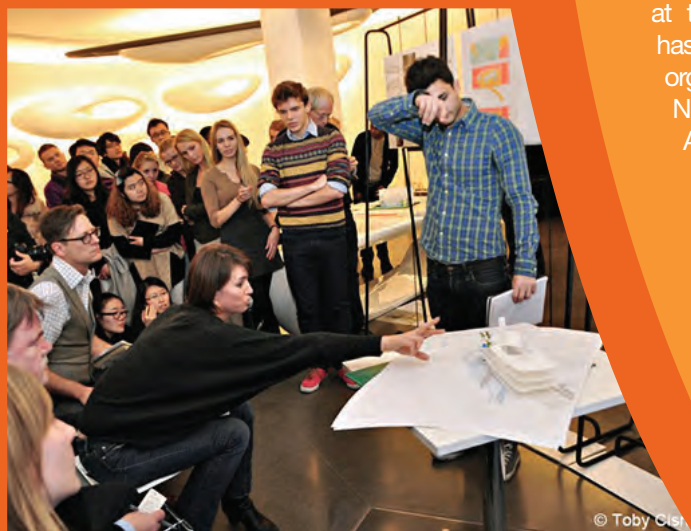
Student Design Charrette