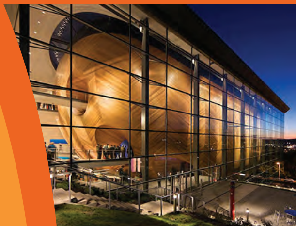
Experimental Media and Performing Arts Ctr.