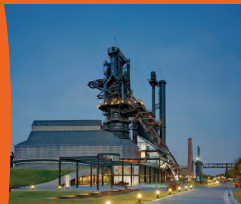
Museo del Acero