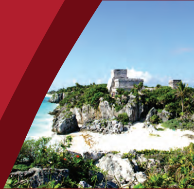
Tulum View from Temple Watchtower