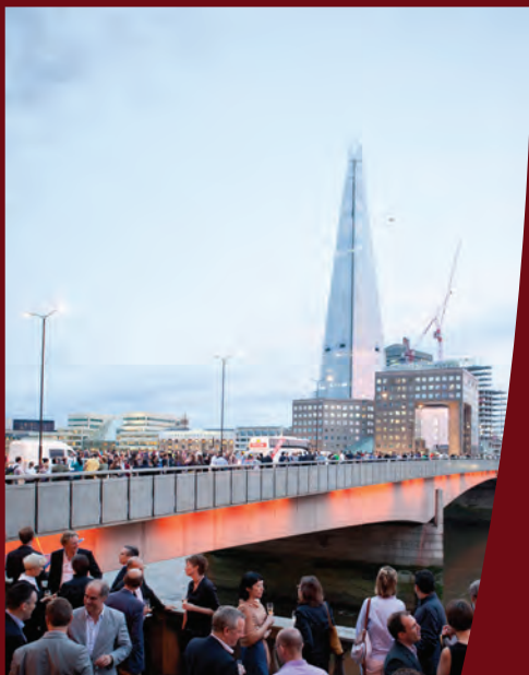
Summer Gala 2012