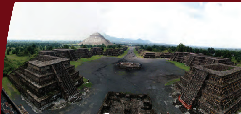
Panoramic View of Teotihuacan

For details on how to enter the student competition for the 2013 Design Awards, please visit the AIA UK website later this year.