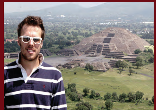
Teotihuacan Moon Pyramid taken atop Sun Pyramid