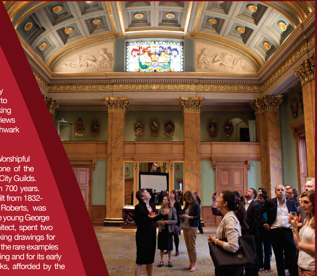
Summer Gala, Fishmongers' Hall