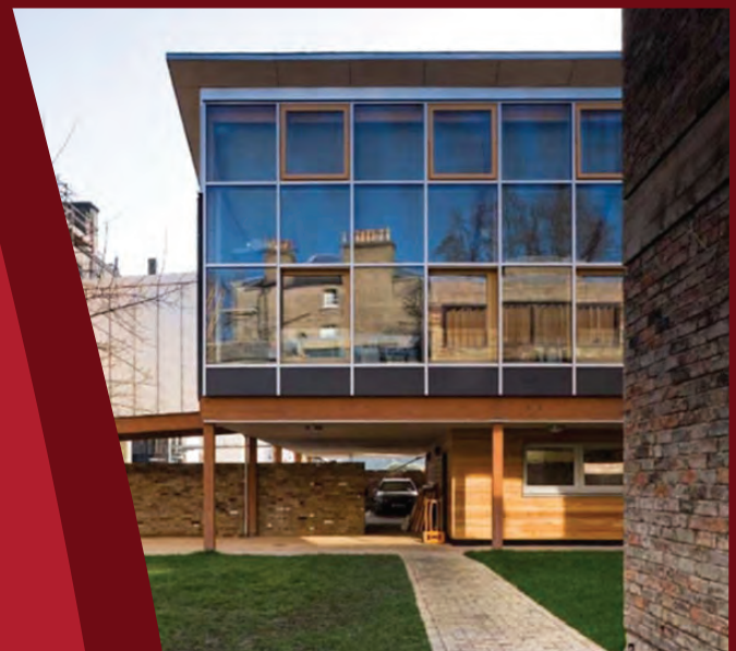
Cambridge School of Architecture Mole Architects