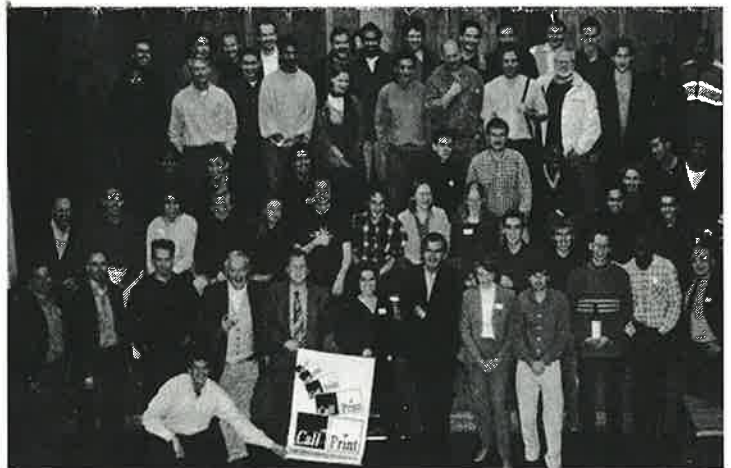
Above: The entire Design Charrette group, gather for an end-of-day photo.