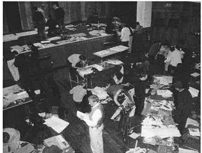
Above: The Design Charrette teams work to the end as the presentation deadline draws near.