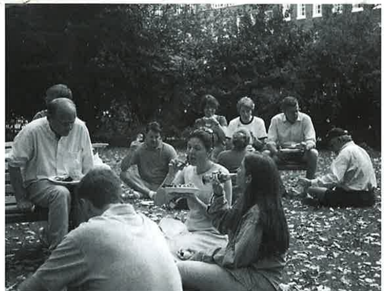
Above: Chapter members enjoying themselves at the AIA's summer B-B-Q in Bedford Square.

Continuing Education < conted@aiaemail.aia.org > Library < library@aiaemail.aia.org > Membership < members@aiaemail.aia.org >