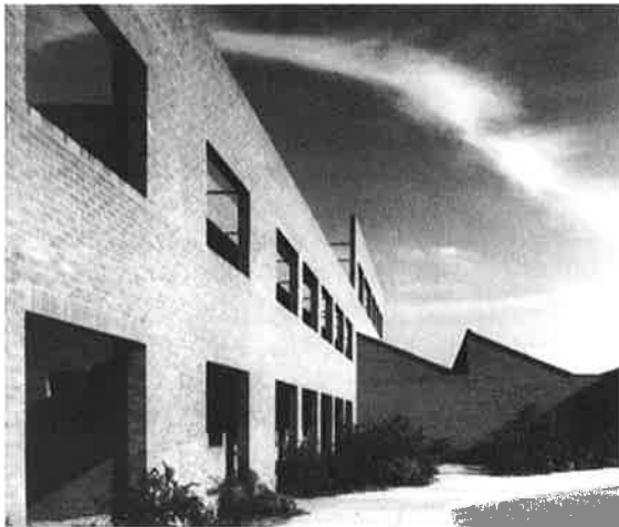
Above: New office wing on research centre near Cambridge

Other projects followed in the region, and Yakeley developed a substantial office in Saudi Arabia staffed from the UK until the 80's, when the oil price-freeze froze the funds. The effect of doing large projects (£150 million) has been to qualify the firm early in its development to do large projects.