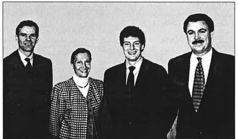
Above: AIA London/UK and Continental Europe stand at MIPIM